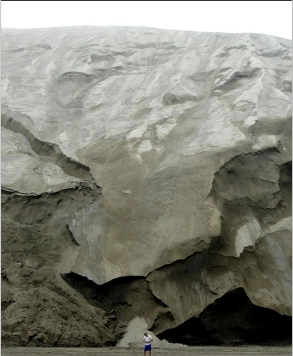
Northern side view of new volcanic island has been formed in the northern portion of Zubair islands group (Red Sea) due to Dec.19, 2011– Jan. 7, 2012, outcrop consist of volcanic ash and scoria (Date of shot: January 17, 2012)