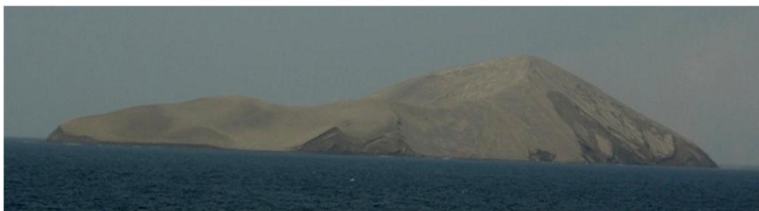
Eastern view of the new island has been formed due to recent volcanic eruption (December 2011– January 2012) in Zubair island group