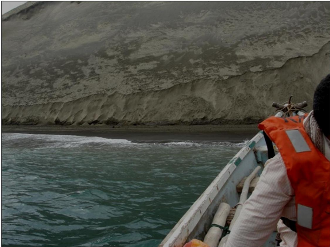
New island northern portion, Yemeni observers are closed to land in the island (Date of shot: January 17, 2012)