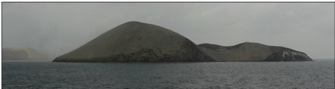
Western view of the new island in Zubair island group, continuous collapse have been reported during Yemeni observers visit in Jan. 17, 2012