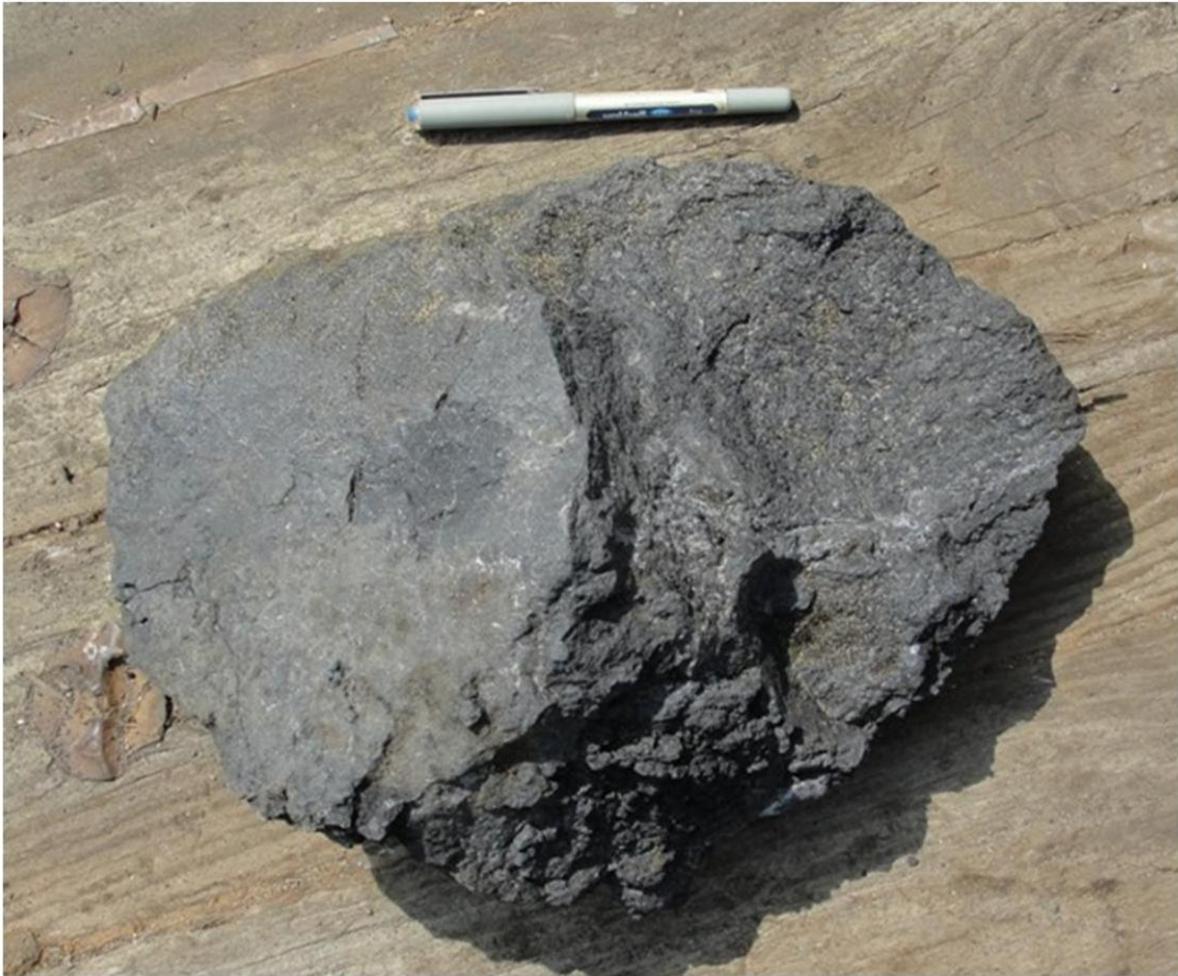
Rock samples from new volcanic island of Zubair islands group