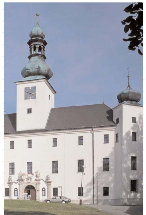
Castle Třešť, owned by the Academy of Sciences, is not only the venue of numerous international conferences but also the site of one of the stations of the Czech Regional Seismic Network.