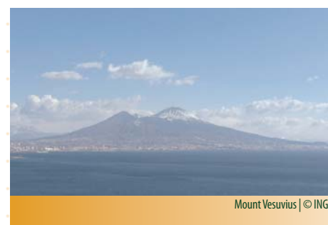
Mount Vesuvius

A comprehensive overview of the EPOS Collaborative area was also offered and persons participating into EPOS were strongly encouraged to have recourse to the services of this efficient tool. Last but not least, it must be recognized that the discussion was indeed strongly facilitated by a warm welcoming buffet and a breathtaking view over Naples' Bay. No doubt the participants were also inspired by the visit of Herculaneum's ruins still subsisting after thousands of years, unless such enthusiasm came from the glasses of Fiano savored Piazza del Plebiscito!