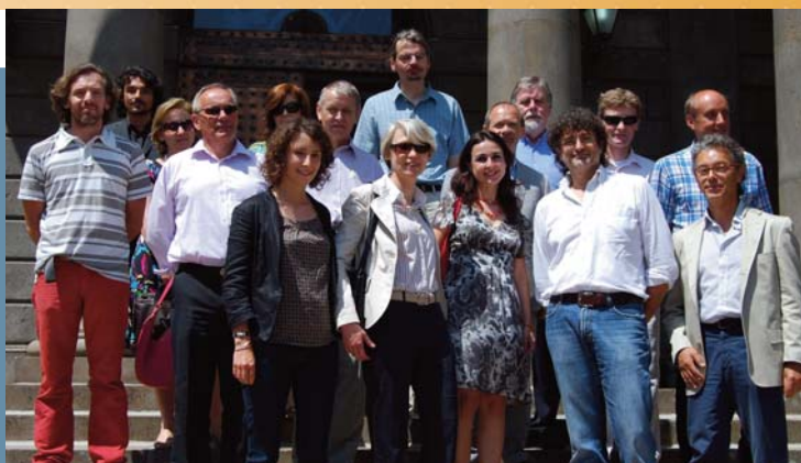
First EPOS workshop on legal and governance issues. June 20 | 21 - 2011, Ercolano

The Council will provide the first occasion to officialise the thematic working groups established in WP6 (Technical Work) and to verify the stakeholders' community involved in the project at this stage. We are going to accurately debate the RIs inventory and the e-infrastructure implementation plans.